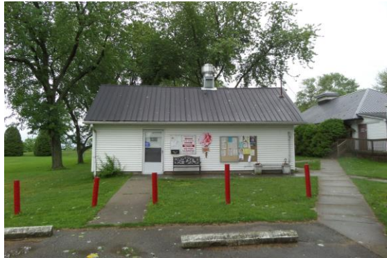
Food Booth & Registration