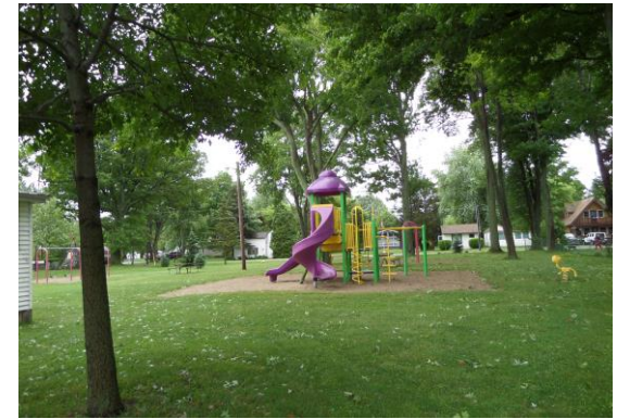
2 - Playgrounds