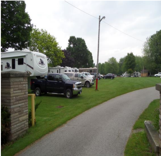
Lawn-Like Trailer Spaces (with electrical, water and sewer outlets) Level 2 Acre Over Flow Area

Reservations are accepted for overnight, weekend, holiday or season through the Port Glasgow Trailer Park, 8650 Furnival Road, Rodney, Ontario N0L 2C0. 519-785-0069