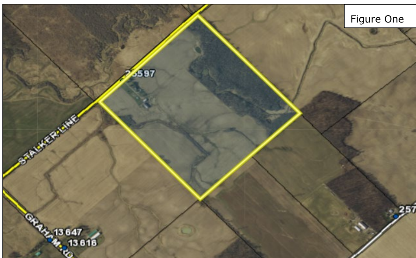
Figure One below, depicts the subject lands:

The surrounding land uses are as follows: