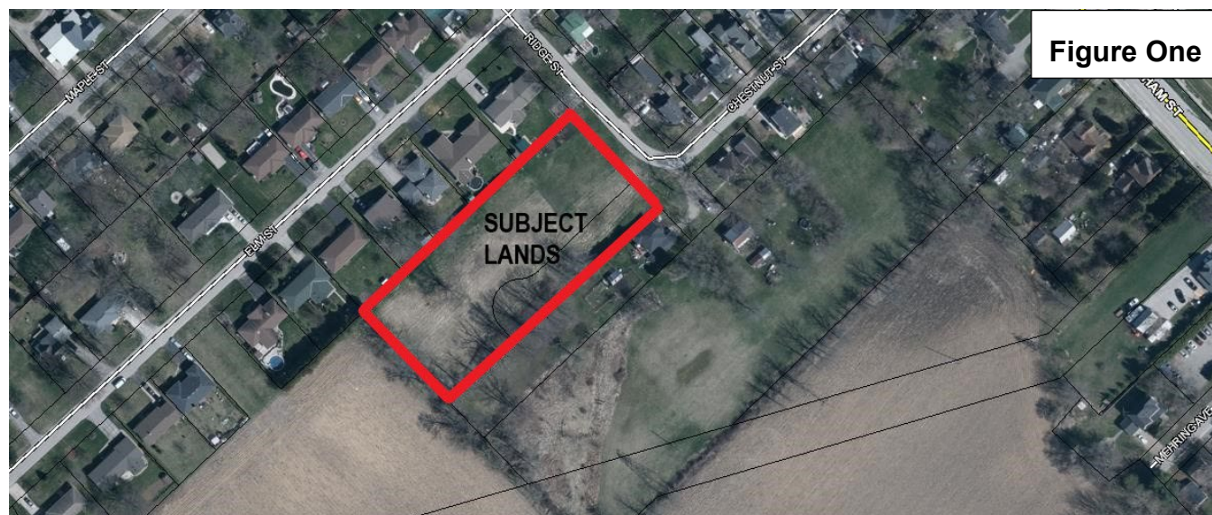
Figure One below, depicts the subject lands:

The surrounding land uses are as follows: