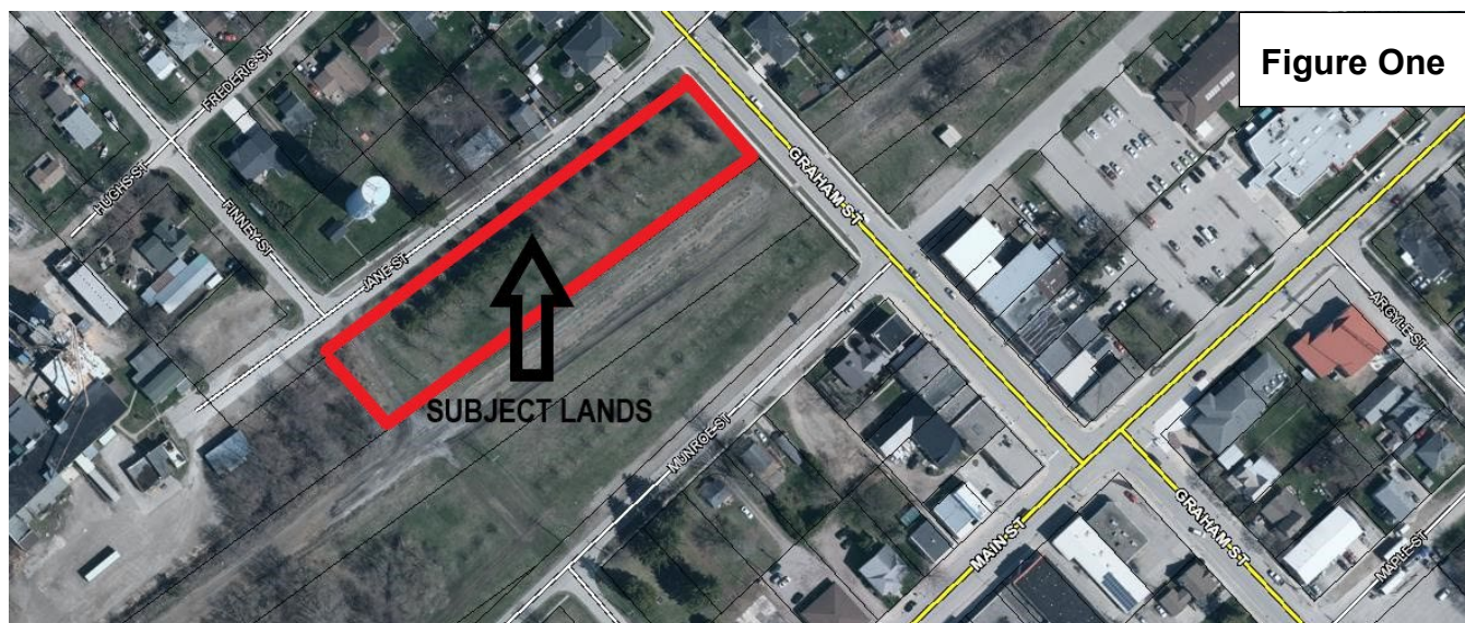
Figure One below, depicts the subject lands:

The surrounding land uses are as follows: